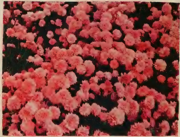
MAJOR CUSHION. 50c each; 3 for $1.25